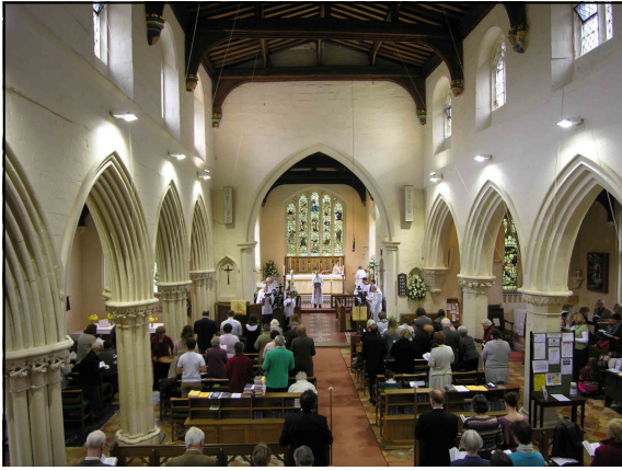
St Mary's, Eaton Bray