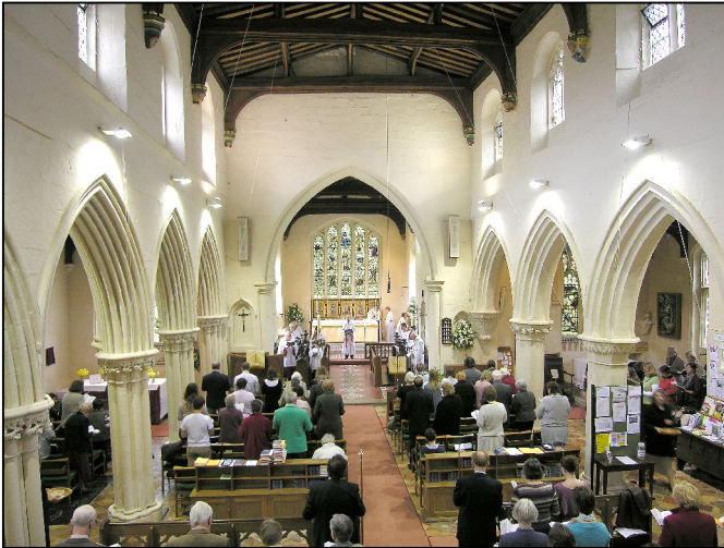
St Mary's, Eaton Bray