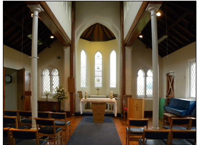
All Saint's, Dagnall